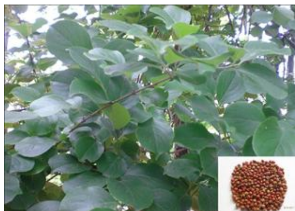
Figure 1: Jyotishmati Plant with seeds

Jyotishmati acts as Medha Stimulator or Intelligence enhancer.