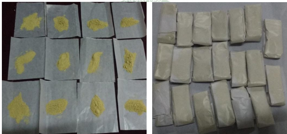
Fig.3 Bhringaraja bhavitha gandhaka kalpa