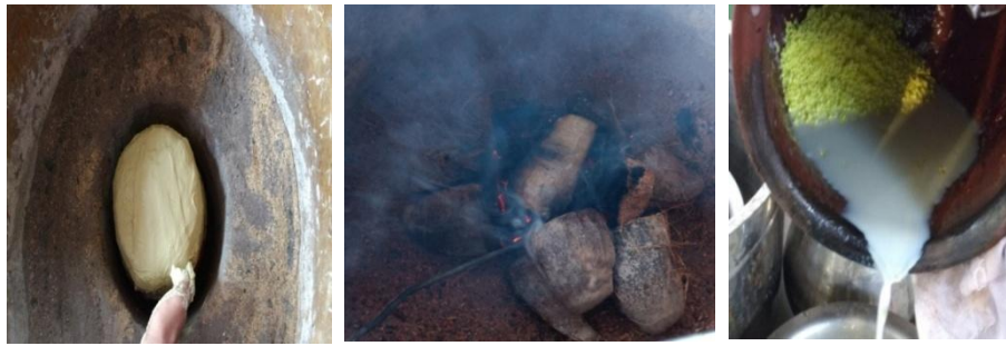
Fig.2 Bhringaraja bhavana of Gandhaka