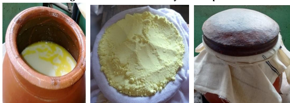
Fig.1 Gandhaka shodhana by Koormaputa

Dose - 1 Masha (750mg) of Bhringaraja bhavitha gandhaka along with 1 Masha (750mg) of Hareetaki choorna makes a single dose. Administered with Anupana of honey and ghee once daily in morning.