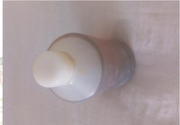
Photo No.4. Preservation of Ksharajala