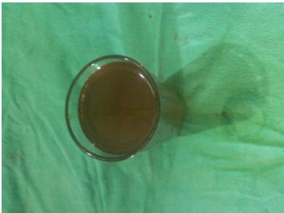
Photo No.3. Ksharajala