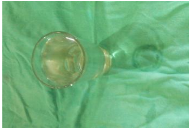
Photo No.2. Distilled Water