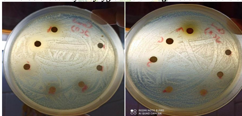
Figure 10: Showing activity of S1