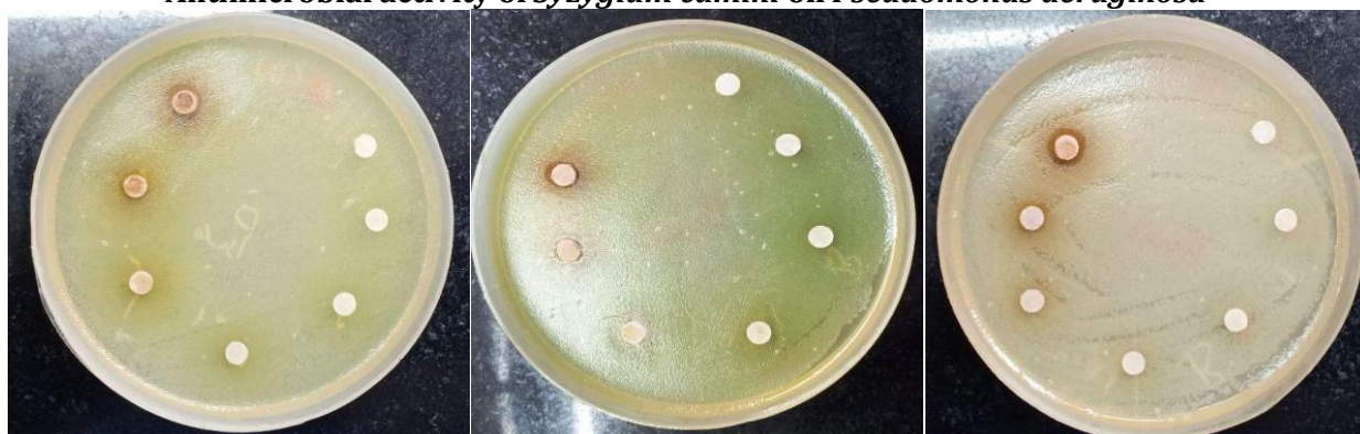
Figure 7: Showing activity of S1 Figure 8: Showing activity of S2 Figure 9: Showing activity of S3