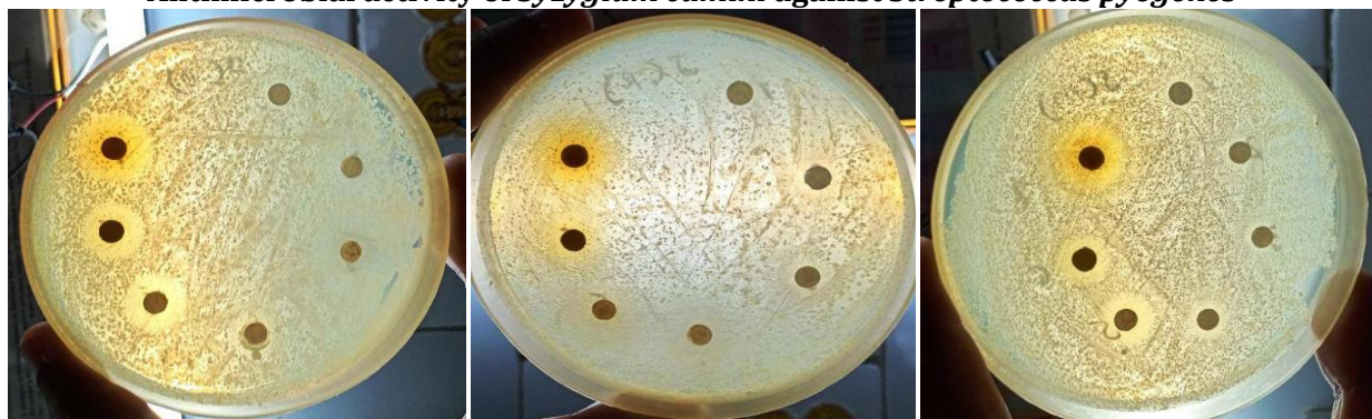
Figure 4: Showing activity of S1 Figure 5: Showing activity of S2 Figure 6: Showing activity of S3