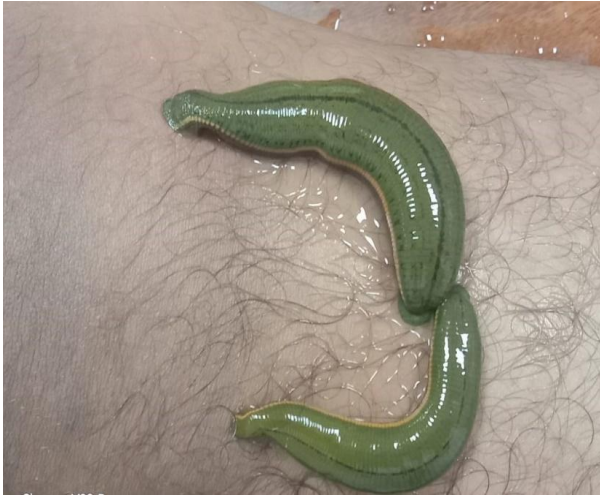
Figure 3: Showing Bloodletting through Leech therapy

Suchiviyadhana (Needle puncture): This is a unique technique of bloodletting. References are found in Tibetan and Traditional Bhutanese medicine of the use of Golden needles. [20] Presently for the collection of medial collateral ligament tightness in the Varus knee. According to the site of puncture different gauze of needles are used. In Charak Samhita, the same is indicated for treating gouty arthritis [21] .