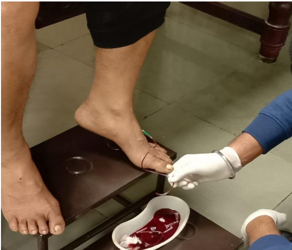
Figure 1: Showing Bloodletting through Vein puncture

Siravyadhana (Vein puncture): The procedure of puncturing vein for therapeutic purpose is called Vein puncture. It is a main and most important method of bloodletting. In this method, up to 750ml (1 Prastha ) [15] of blood can be taken out from the patient's body. The patient is made to lie down or sit in a comfortable position. The part chosen for the vein puncture should be tied with a tourniquet. With the help of needle/scalp vein no. 18 to 22, the vein is duly opened or punctured. The blood is allowed to flow onto a measuring glass. Nowadays, needle with IV set are used. Usually, the bleeding stops by itself but, if the bleeding does not stop by itself, a pressure is applied with cotton for 2 to 3 minutes. In postoperative care, paste of turmeric powder mixed with honey is applied.