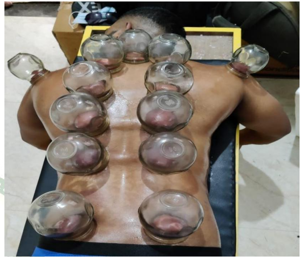
Figure 2: Showing Bloodletting through Cupping Jaloukavacharana [19] (Leech therapy):

Ghatiyantara [18] (Cupping therapy) - Bloodletting done by the application of glass / small earthen pot is known as Ghatiyantara avacharana (cupping therapy). On the selected area - 3 to 4 pricks are made with the help of sterile needle that leads to a pin point bleeding. The Ghati yantra is wiped from inside with spirit gauge and heated with match stick which was then quickly placed on the bleeding points. As, it was flamed inside, it creates a vacuum because of the consumption of oxygen by the flame which raises the local area to form a bulge and blood oozes out. Same position is maintained till the flow of blood stops and the blood gets clot, after which the Ghati yantra is removed and the area is cleaned with a piece of gauge.