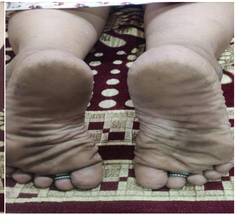
Figure 5. After treatment