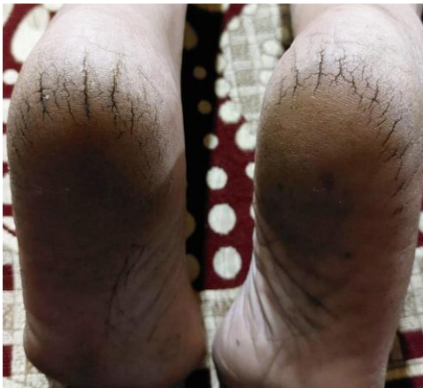
Figure 3: Before treatment