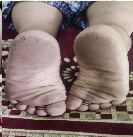
Figure 4: During treatment