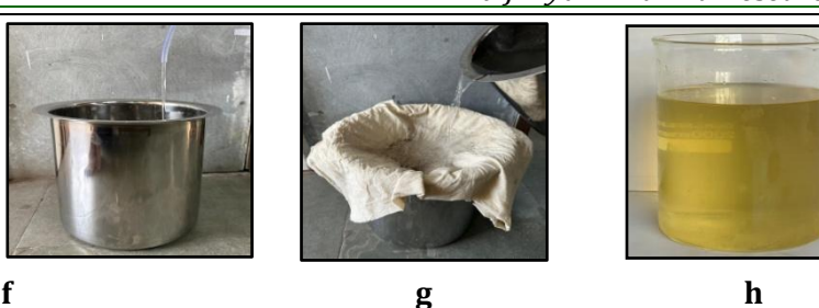
Plate – 5 Preparation method of Ushtrapriya Ksharajala: a-Rudanti ash and water,b-Keep undisturbed for three hours, c-Decantation of Ksharajala after 3 hours, d- Filtration of Ksharajala, e-Keep again undisturbed for twelve hours, f-2nd time decantation of Ksharajala after 12 hours, g-2nd time Filtration of Ksharajala, h-Rudanti Ksharajala from Rudanti ash