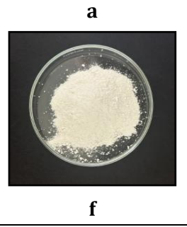
Plate – 3 Preparation method of SKU : a -Heating of Ksharajala , b -Slurry form of Kshara , c -Shift material to indirect heat, d - Granules form of Kshara , e -Last stage of Kshara preparation, f - Swarjika Kshara from Ushtrapriya