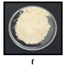
Plate – 6 Preparation method of SKR : a -Heating of Ksharajala , b -Slurry form of Kshara , c -Shift material to indirect heat, d - Granules form of Kshara , e -Last stage of Kshara preparation, f - Swarjika Kshara from Rudanti