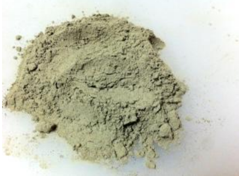
Fig 1: Seenthil Sarkarai

Clean the Seenthil stem ( Tinospora cordifolia ) and crush it. Soak the crushed drug in water and stir well. Next day remove the coarse part of the drug from the water. Keep the water in the vessel under the sunlight for two to three hours until sedimentation occurs. Pour out the clear supernatant water and collect the sediment. Add some more water to this and remove the remaining coarse powder. Allow the starch to settle down and collect it and then make it to dry.