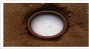
Pot filled with milk placed in a pit