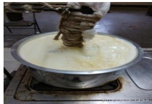
Pottali subjected to Swedana