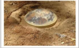
Pot is sealed with Sarava