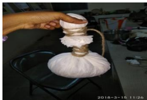
Made into Pottali