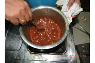
Reheated on mild