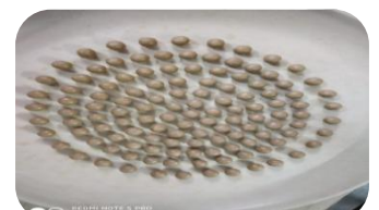
After all these ingredients mixing into homogenous mixture final Vatari Guggulu vati