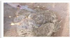
Ignited cow dung cakes over the Sarava