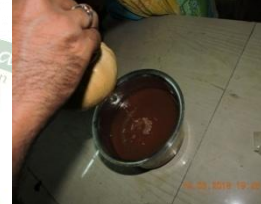
Squeezed after Swedana