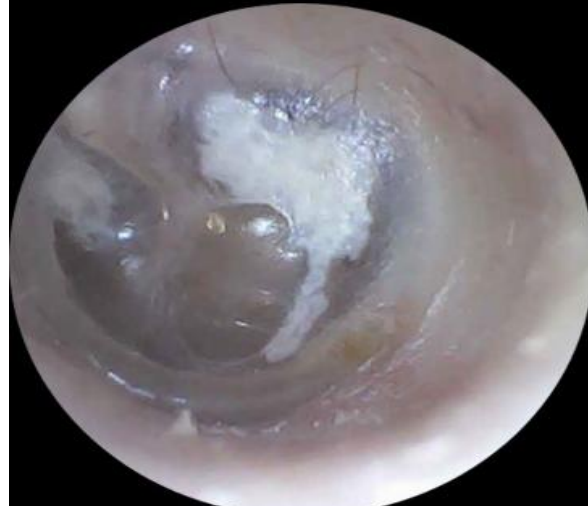
Figure 3: Left ear intact TM with TS patch