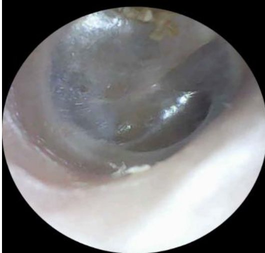
Figure 2: Right ear healed perforation

reported by the patients. This positive outcome indicates the safety and well-tolerated nature of the treatment.